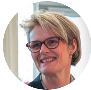
Dr. Angela Merkel German Chancellor

“ Federal Minister of Economics Peter Altmaier often talks about the ‘data airbus’. The data airbus is the infrastructure. And IDS is the engine driving it along. ”